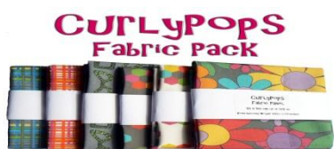
6 Fabric Panels Featuring original designs – each 53x50cm